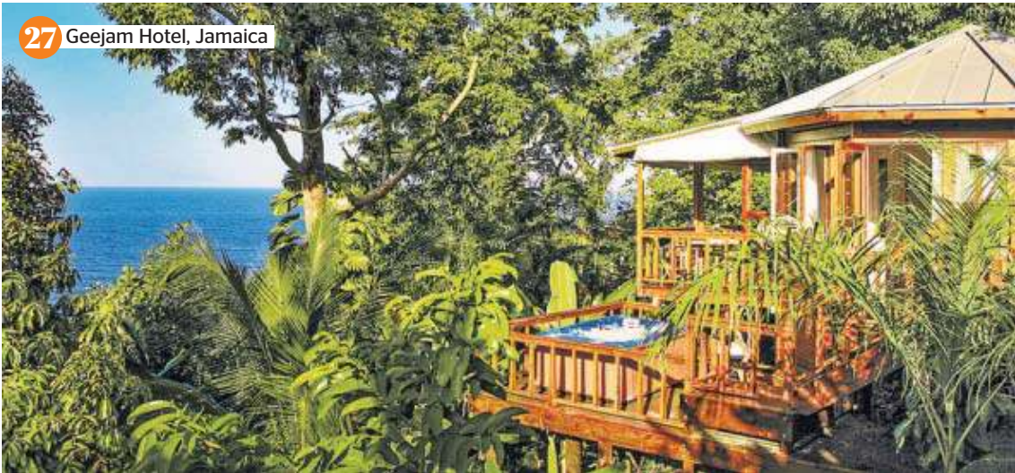
27 Geejam Hotel, Jamaica