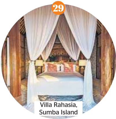
Villa Rahasia, Sumba Island