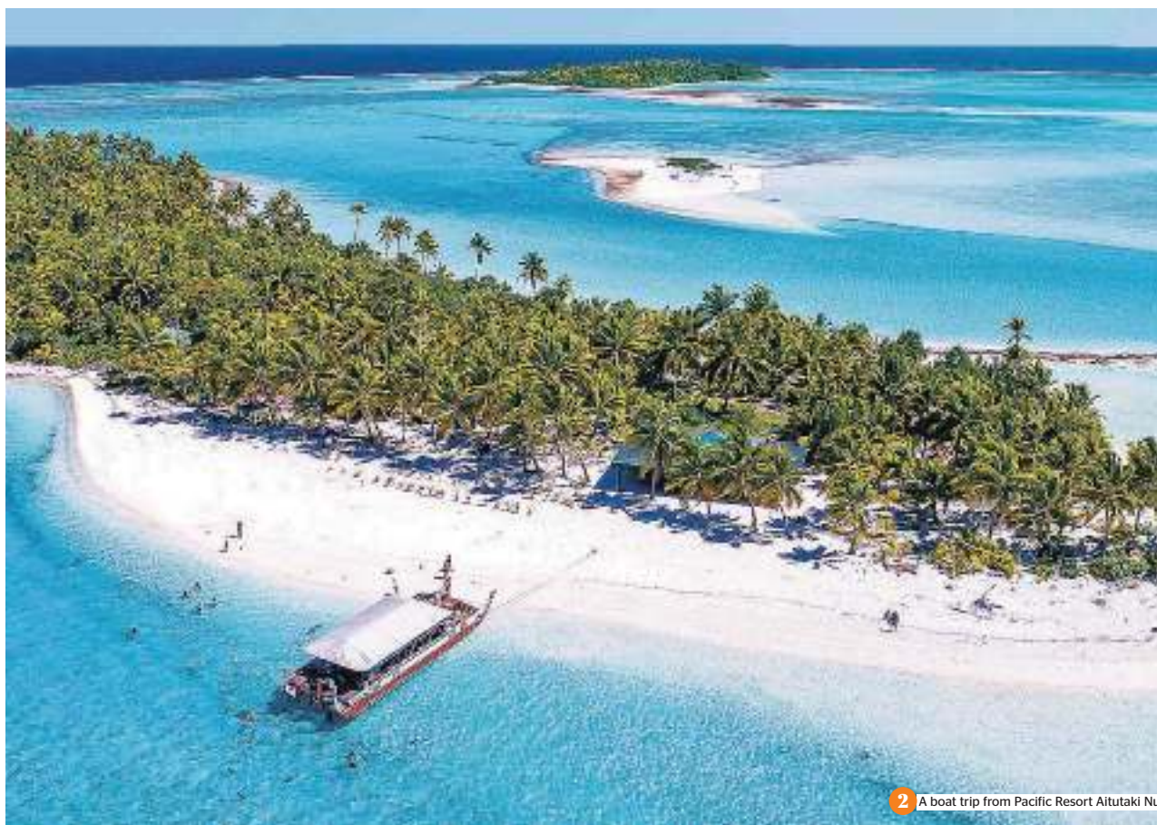
2 A boat trip from Pacific Resort Aitutaki Nui