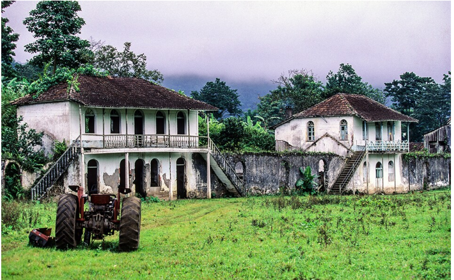
The islands were once the epicentre of a cocoa trade

Quaker chocolatiers Cadbury, Rowntree and Fry, social reformers who had campaigned against slavery, demanded a boycott of cocoa beans from Sao Tome in 1909. This contributed to the ruin of the island plantations and the beginning of the end of Portuguese rule. They left, unceremoniously, in the mid-1970s.