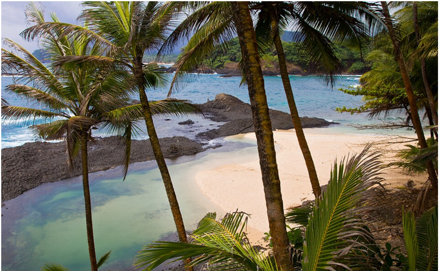
Principe's beaches are a remote paradise

Belo Monte has the rare and precious sense of unhurried time that defines Principe. Staff gathered for amused chit-chat every morning under the shade of a magnificent tree, the leaves of which make an aphrodisiac potion that they counselled my husband to enjoy. They smiled at my impatient desire to hike every mountain in the area. My eagerness was contrary to the easy-does-it, “moli-moli” pace of life. They pointed me in the direction of the beach. I agreed; what better way to immerse oneself in this languid island vibe than from a hammock strung across the palms?