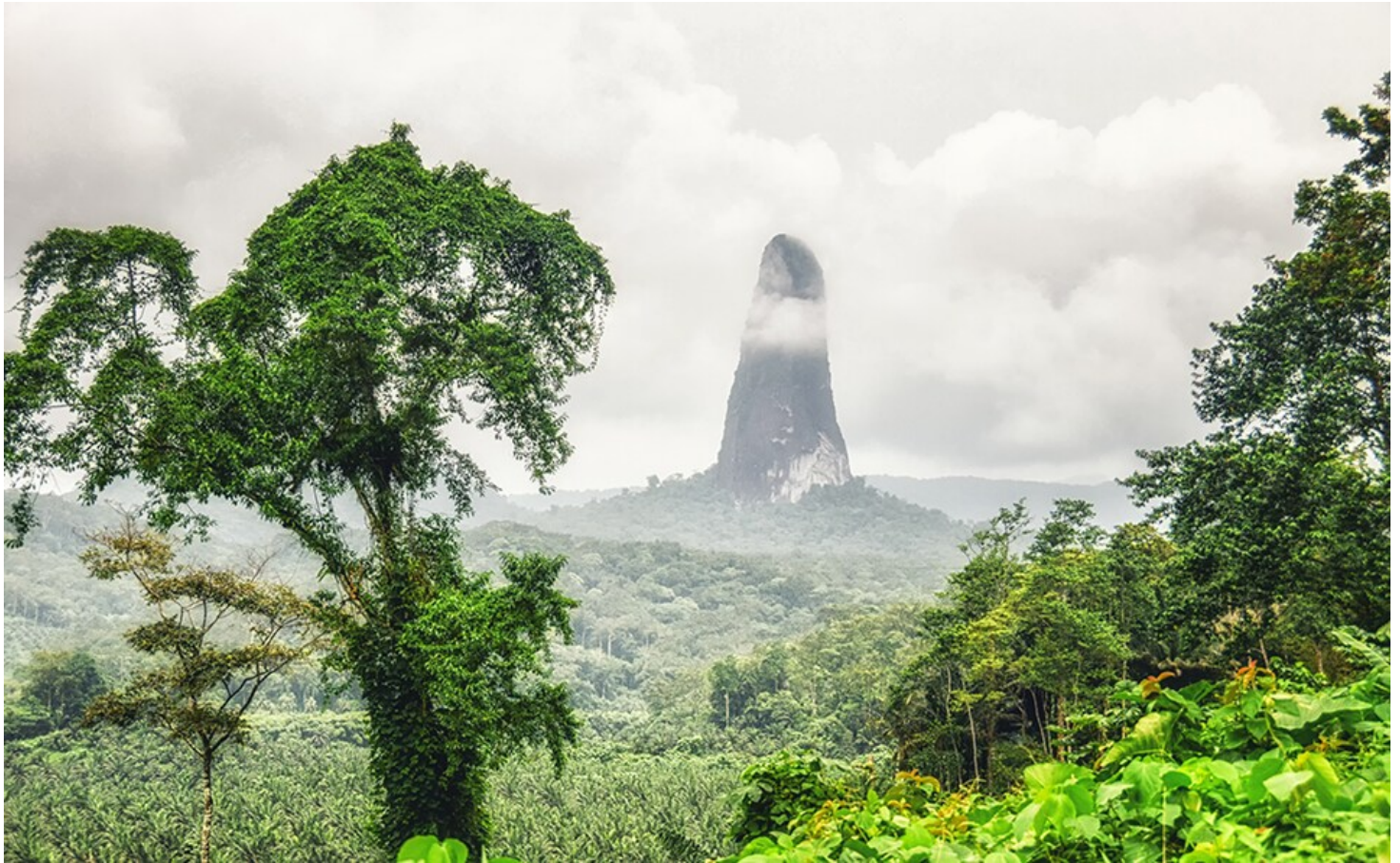
The mountain peak of Cao Grande is unmissable

We talked about the islands' fragile status quo, teetering on the cusp of change; the pressures and potential benefits of foreign interest and investment in the crude oil beneath the Atlantic, and the controversial plans for further palm oil plantations which, while an ecologically destructive monoculture, bring employment to poverty-stricken regions.